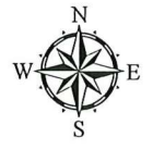
Exhibit 'A' Proposed Changes New Road 218, 219, 122