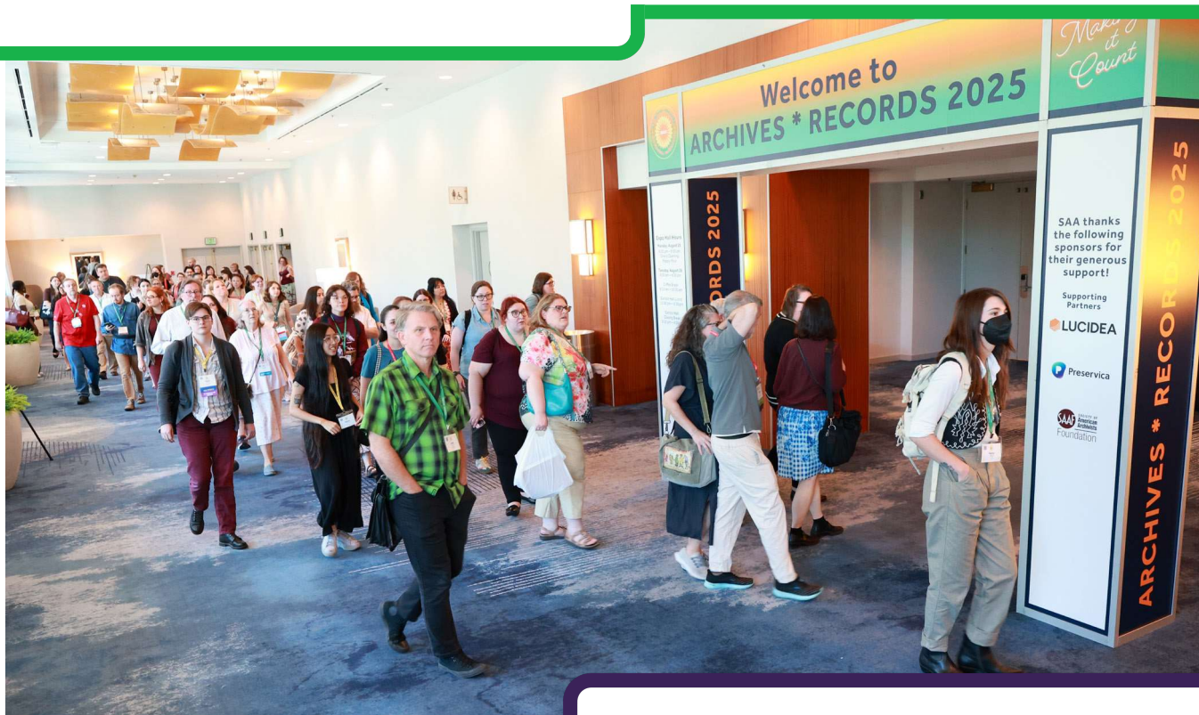
All conference attendee photos courtesy of Craig Huey Photography, LLC.

On occasion, a photographer may take photos, videos, or other recordings of attendees at ARCHIVES*RECORDS 2026 or of people participating in conference functions or activities. Please be aware that these photos and recordings are for SAA’s use and may appear in SAA conference programs, catalogs, brochures, journals, website, in other SAA materials or as part of SAA media outreach efforts. Your attendance at any SAA conference event constitutes your permission and consent for SAA to utilize your image, likeness, and/or recorded voice as described herein.