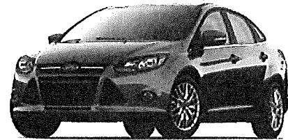
Compact: Ford Focus or similar