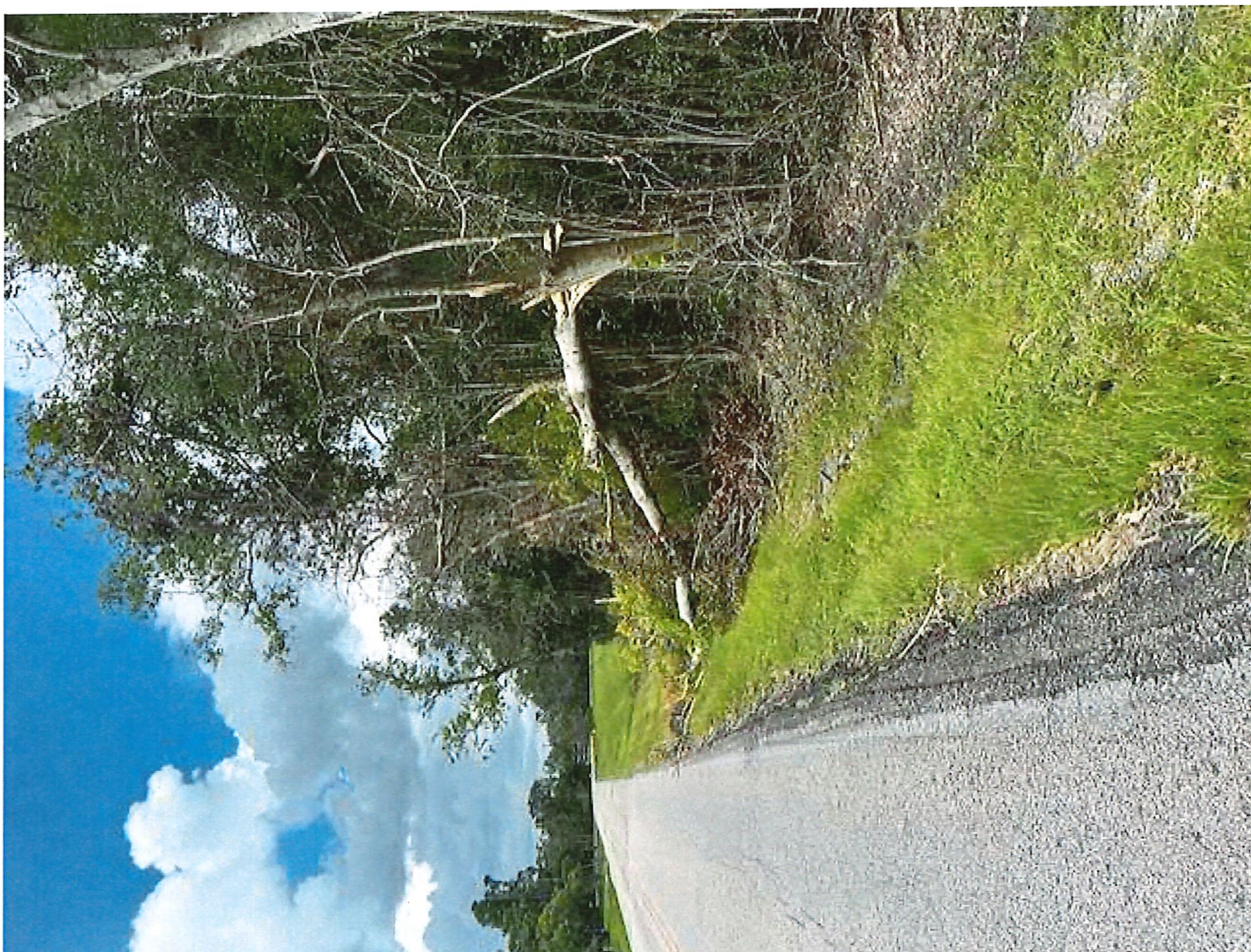
This tree is on West Crestmont on the golf course side of the street Sent from my iPhone

This message has been prepared or disseminated using resources owned by Brazoria County and is subject to the County's policies on the use of County provided technology. E-mail created or received through the County's computer system by any County employee or official may be considered a public record, subject to public inspection under the laws of the State of Texas.